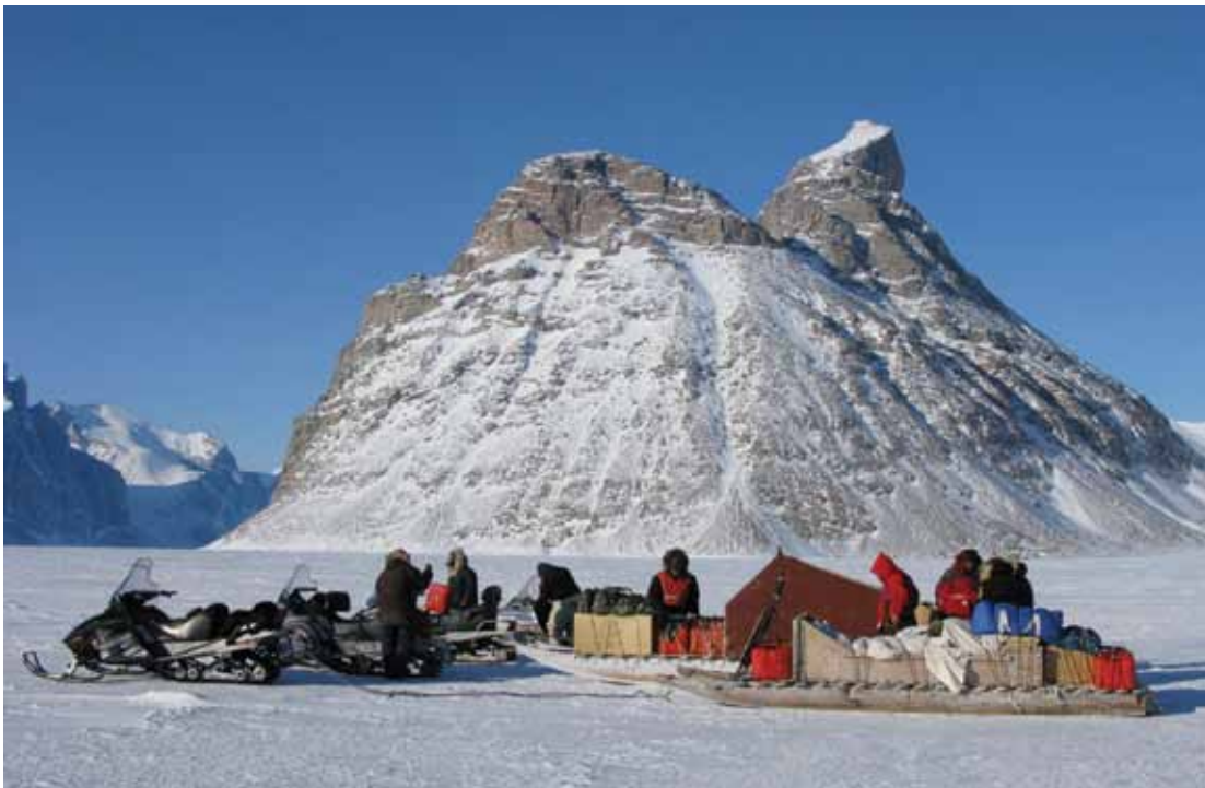
Piqqusilirivik students refuel at Kangiqtualuk, near Clyde River, Apr., 2010.