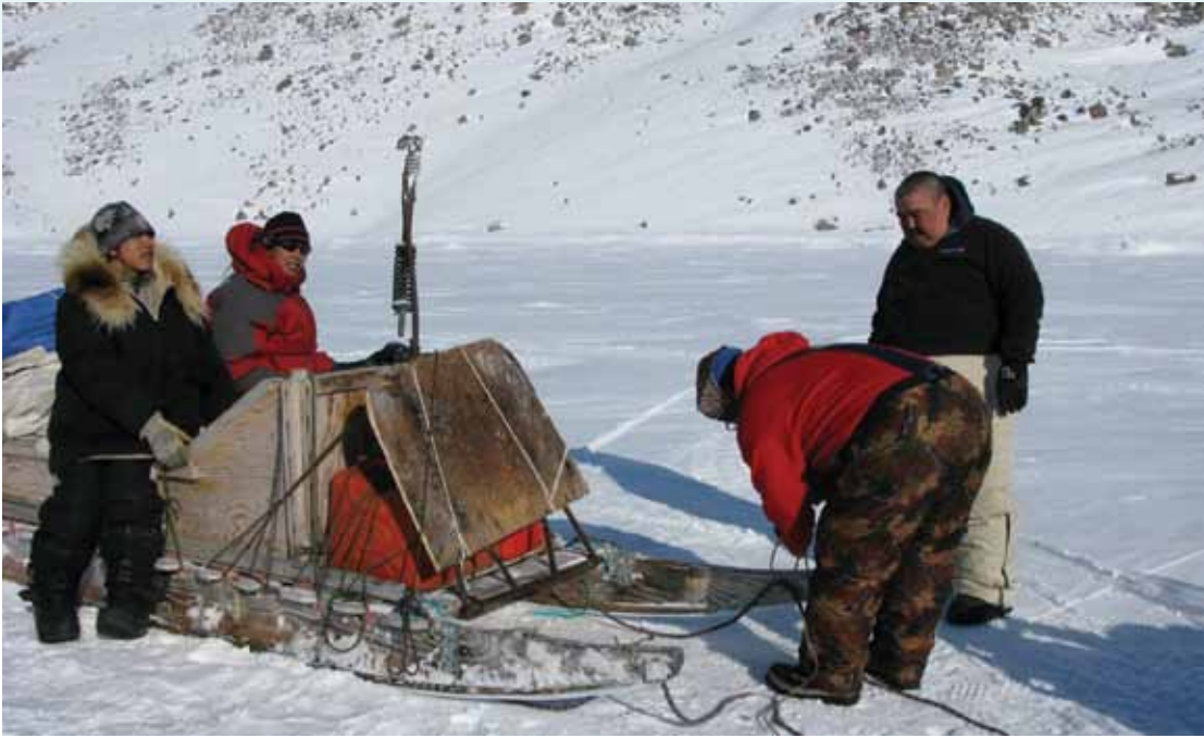
A Piqqusilirivik instructor demonstrated the different techniques and methods used to secure the qamutik down a hill, Apr., 2010.