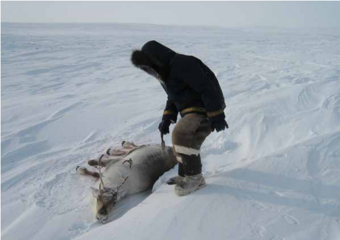
Piqqusilirivvik participant catches caribou outside Igloodik, 2008.

Serious Inuinnaqtun revitalization efforts in Kugluktuk and Cambridge Bay are fairly recent. In 2006, the Tahiuqtiit Society was formed as a model program under the rural secretariat to develop local solutions to local challenges. The mandate of the federally-funded society was to build community capacity through the delivery of training and educational programs providing new opportunities to people who historically were underserved in the community. That year, the society organized an Inuinnaqtun conference in Kugluktuk. Ten representatives from each Inuinnaqtun speaking community met to