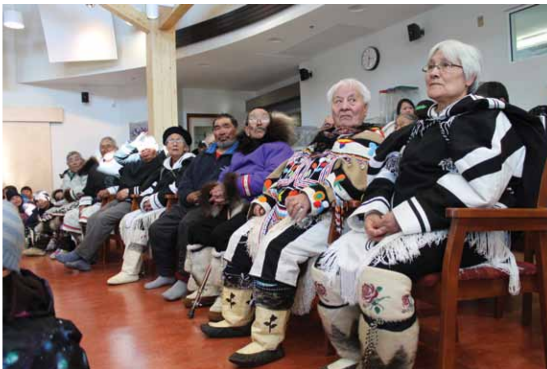
By Emily Joanasie

By contrast, Section 168(1) of the Education Act defers these powers of the minister of Education to the director general of the Commission scolaire francophone , giving the francophone community separate and full control of their own education system. The act effectively creates a two-tiered, ethnically divided education system in which Inuit interests are treated as subordinate to those of the French community by virtue of the fact that the francophone community has exclusive control over French education while the Inuit community has no control.