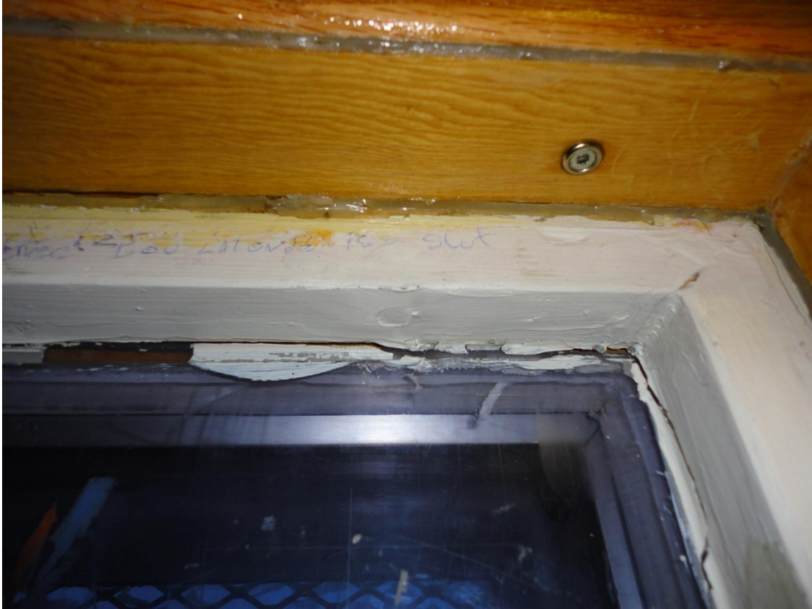
Window in a cell of the Behavioral Unit