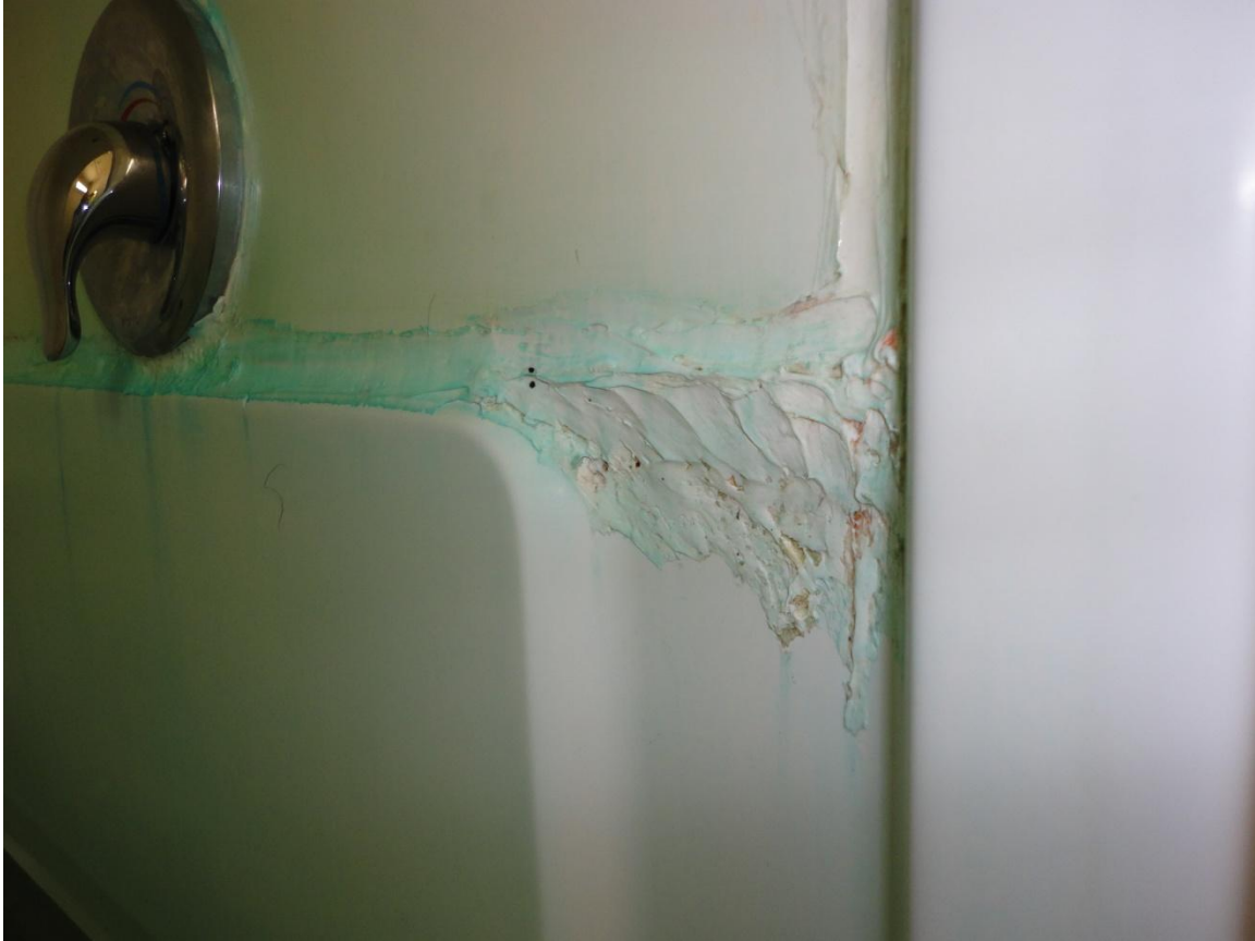
Partial view of the shower of the only shower of the Behavioral Unit