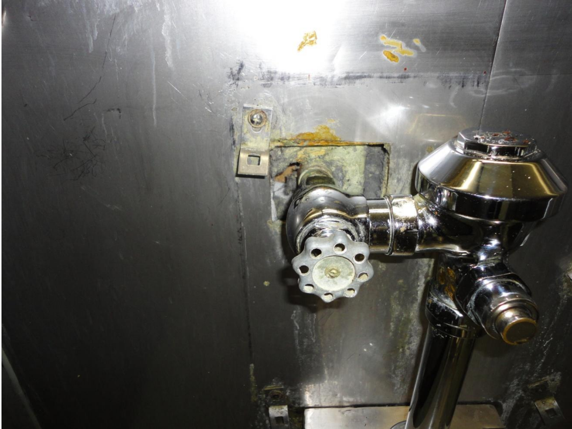
Detail view of the toilet of the Dorm Unit