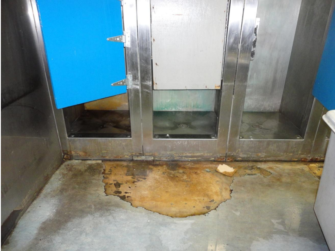
Showers of the Dorm Unit, also used by inmates housed in the Gymnasium