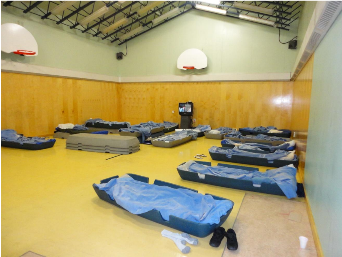
Gymnasium (used as dormitory)