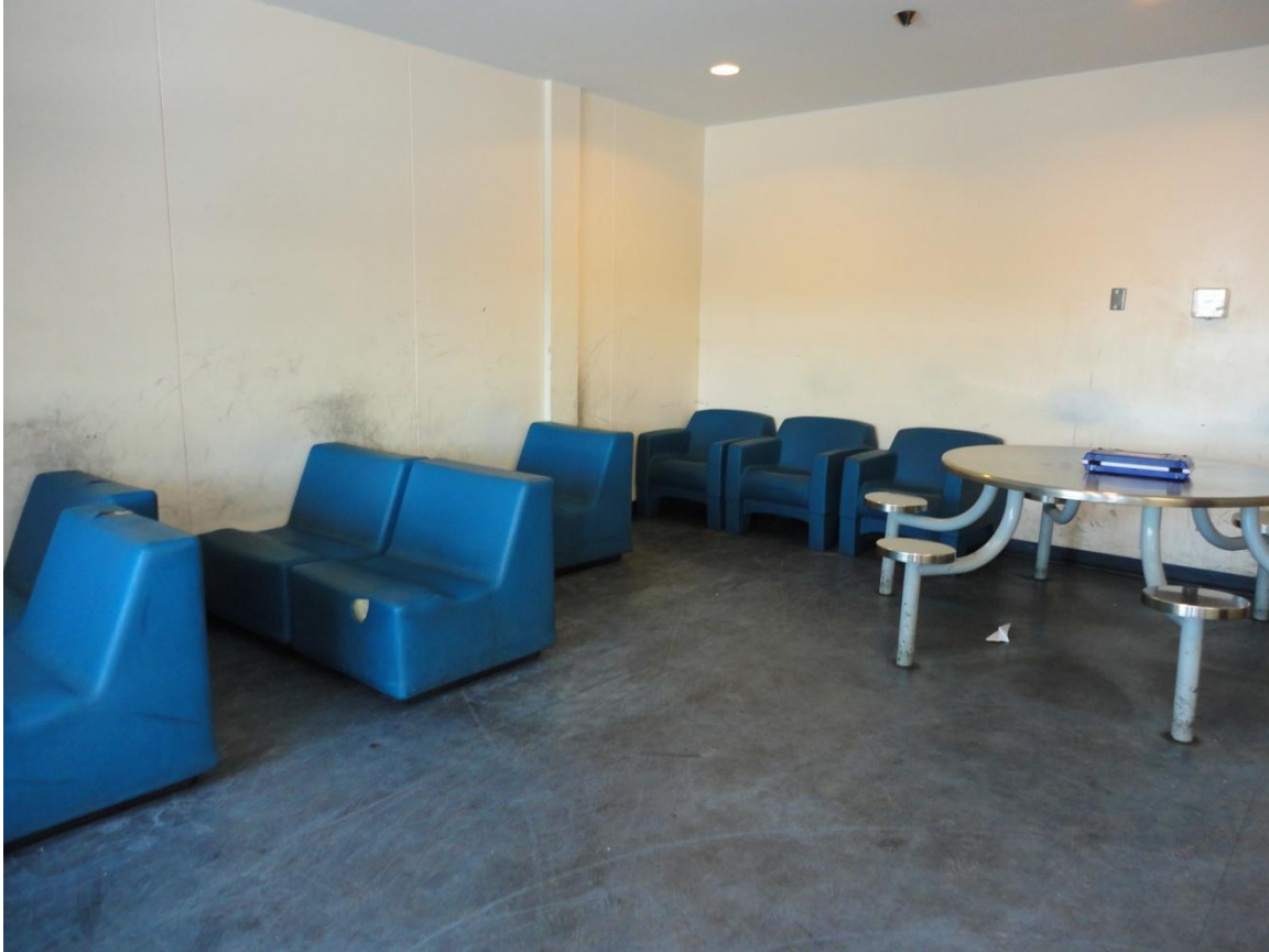
Common room of the Dorm Unit, housing 42 inmates