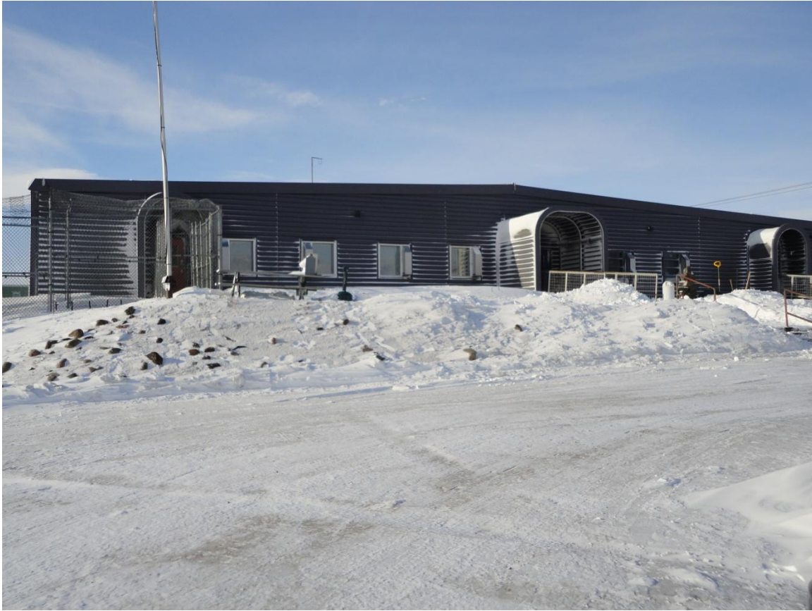
Exterior view of the Baffin Correctional Centre