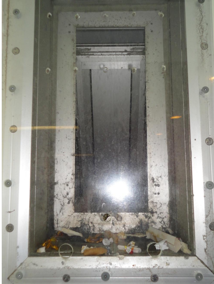
Window in the common room of the Dorm Unit