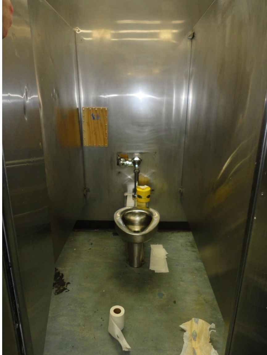
One of the toilets of the Dorm Unit