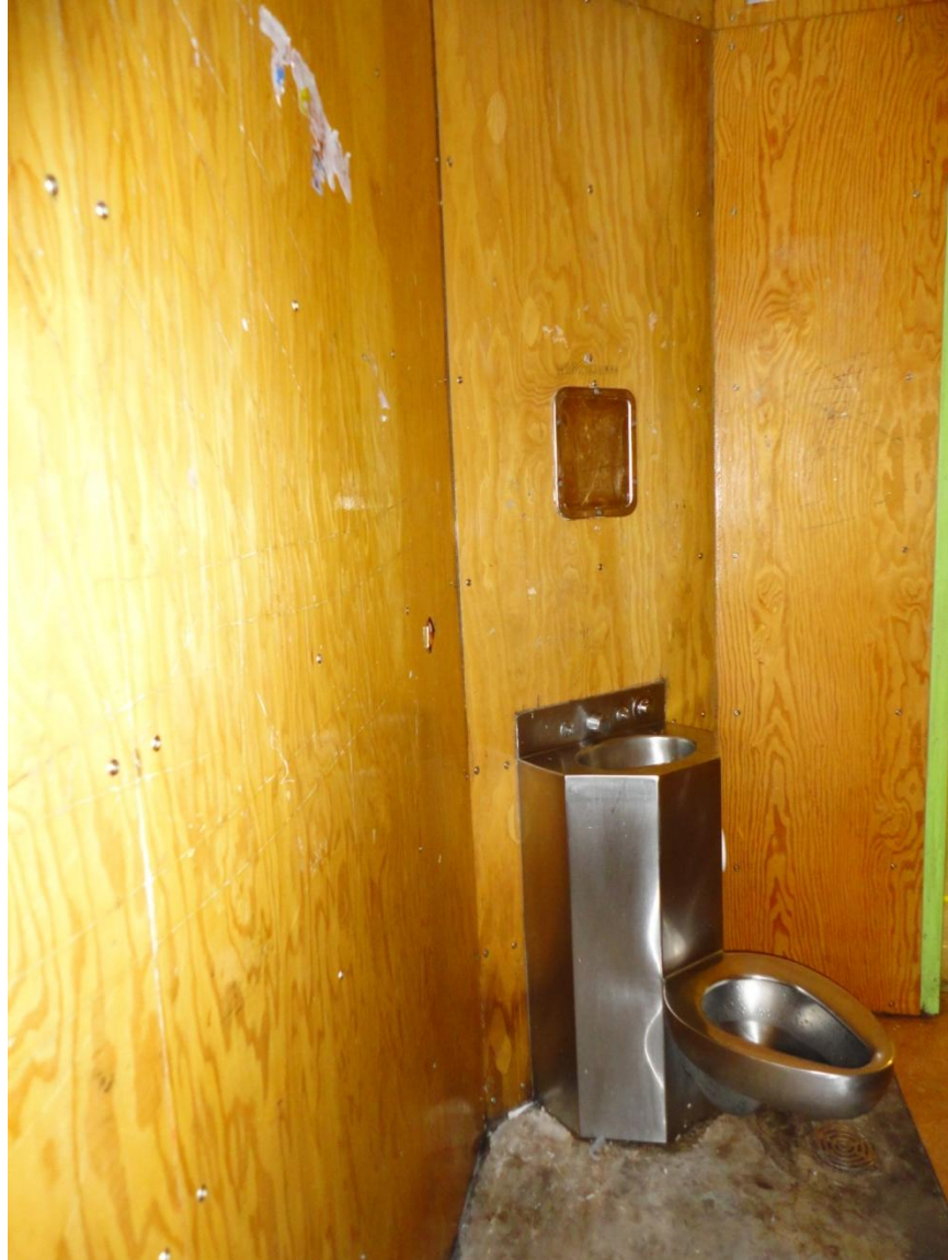
View of another cell in the Behavioral Unit