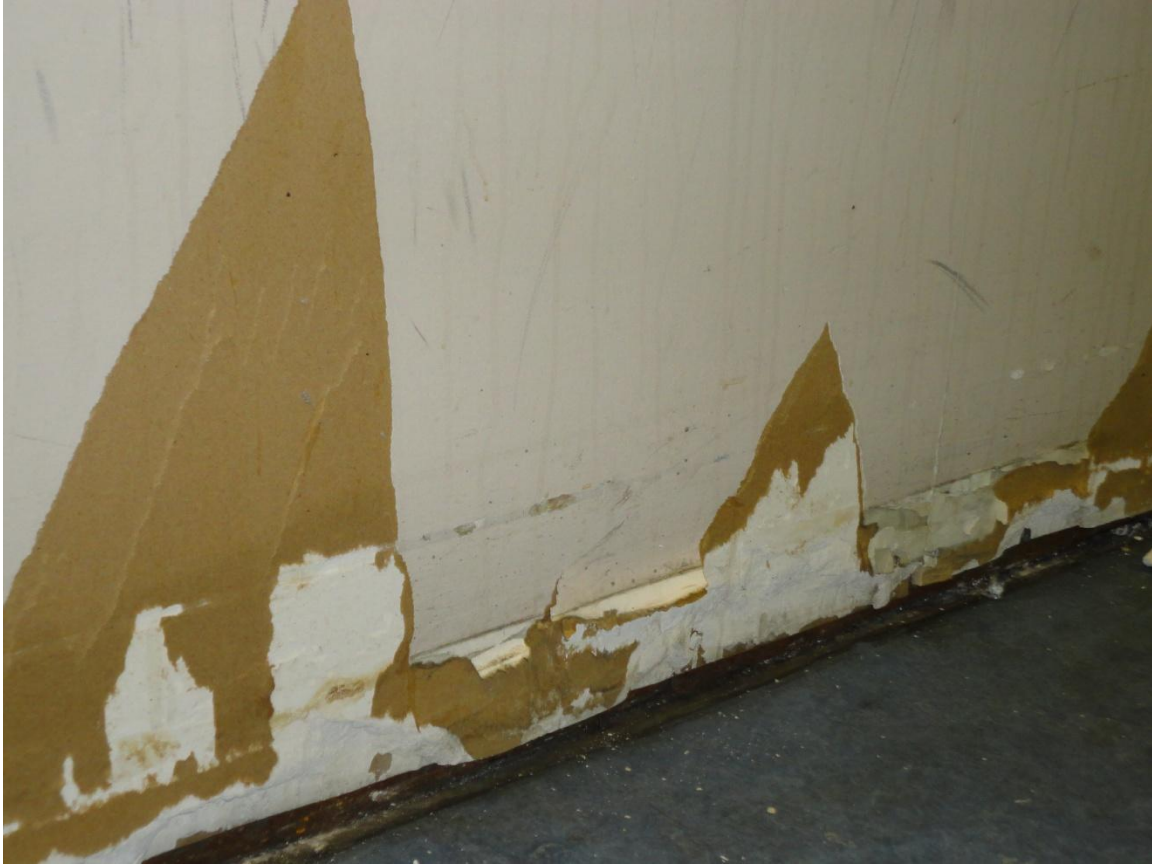
Bottom of the wall in the hallway next to the Behavioral Unit