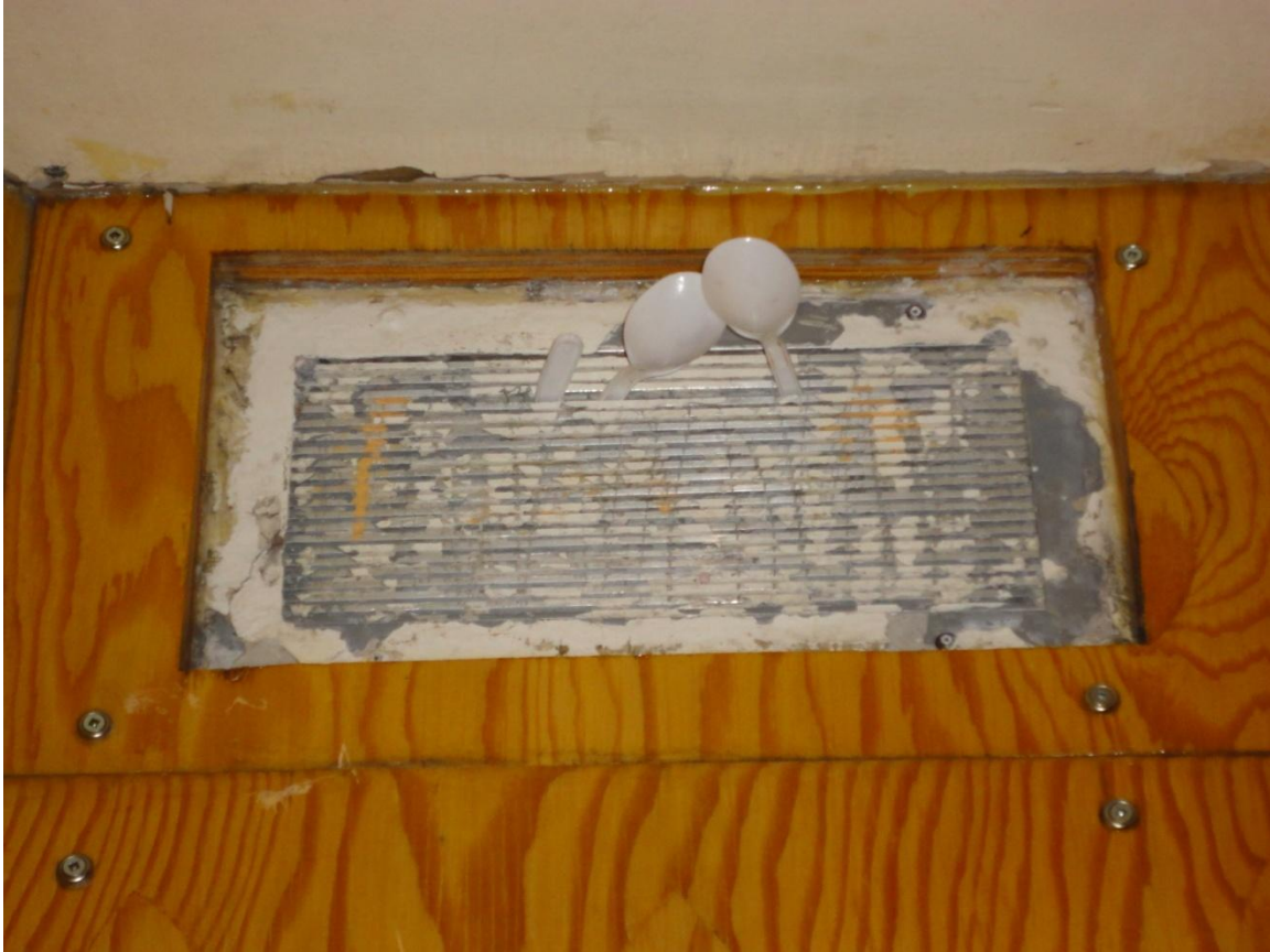
Vent in a cell of the Behavioral Unit