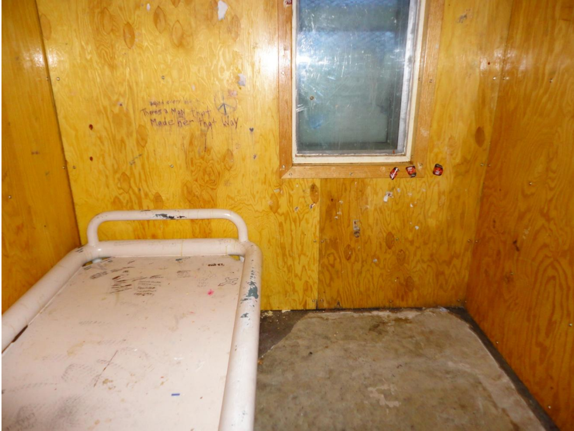
Another view of the previous cell