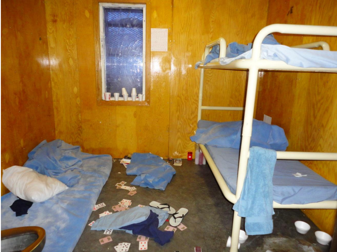
Cell of the Behavioral Unit