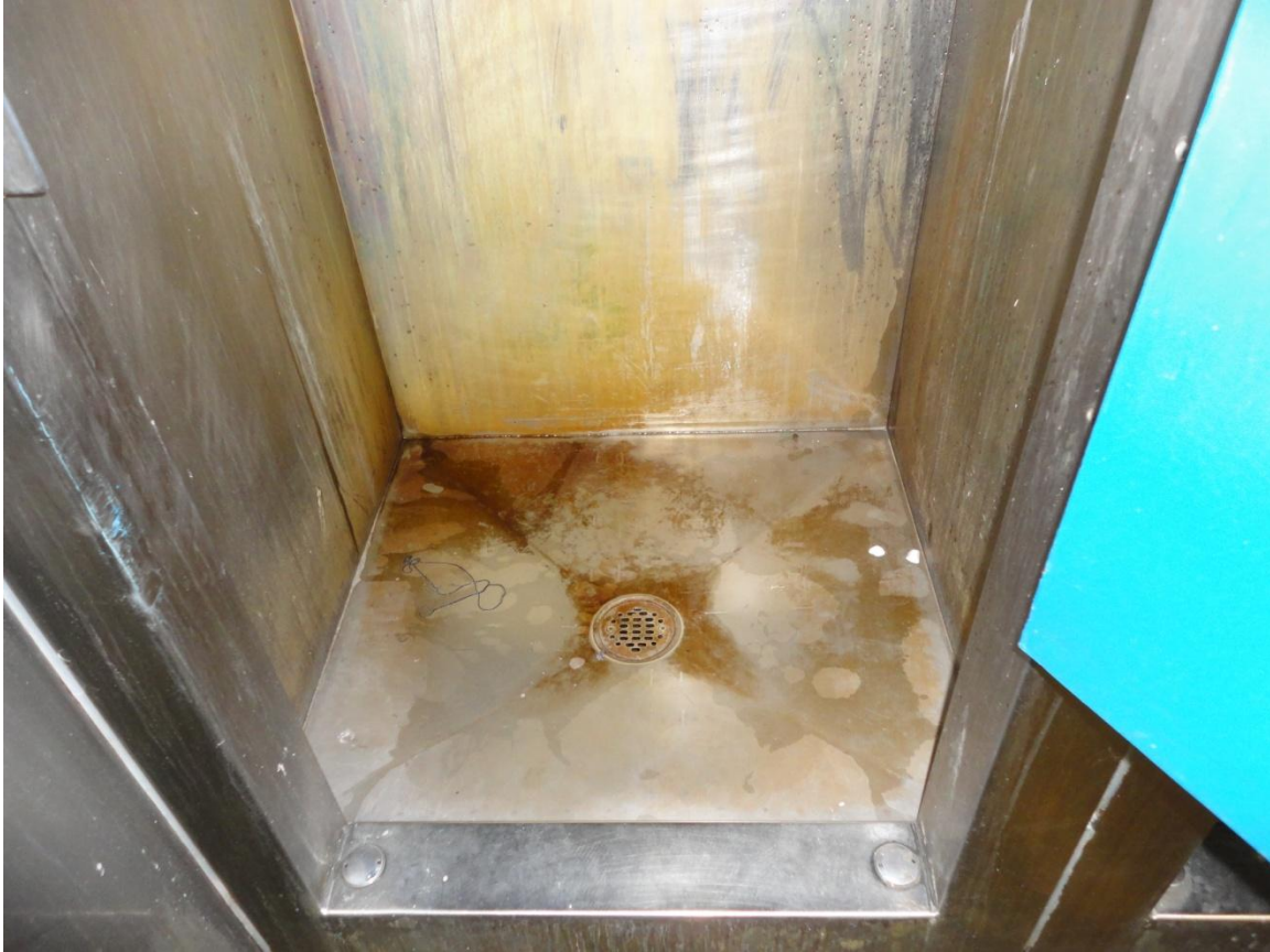
Partial view of the one of the showers of the Dorm Unit