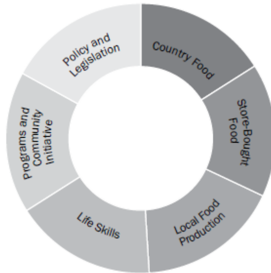
The Nunavut Food Security Coalition's six food security themes

On May 5, 2014, the Nunavut Food Security Coalition released the Nunavut Food Security Strategy and Action Plan 2014/16 . The Strategy is the long-term guiding document for the Coalition and the accompanying Action Plan describes the activities that the Coalition partners have committed to undertaking together in the short-term. The Coalition identified six key themes around which the Strategy is structured. These are outlined in the figure below: