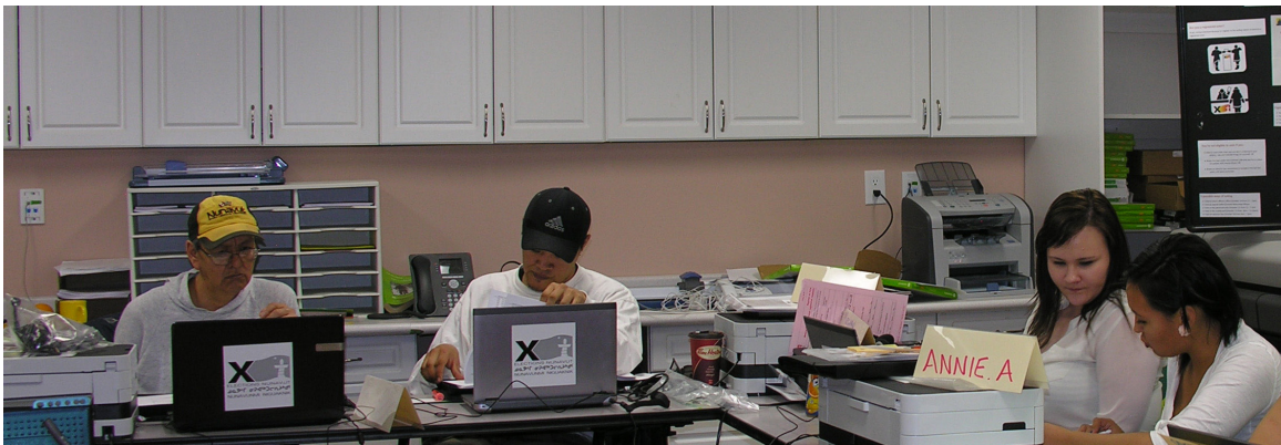
Returning Officers and Assistant Returning Officers training in Rankin Inlet

Four week-long regional workshops for election officers were held in July and August 2013. An additional training session took place in Iqaluit at the end of August to accommodate those who had been unable to take part in earlier sessions. For the first time all Assistant Returning Officers attended these in-person sessions. Not only did this ensure that Assistant Returning Officers had adequate opportunity to learn the technical requirements of the job, it allowed them to develop a solid working relationship with their Returning Officers. Training consisted of three modules: 1. electoral management system RENU, 2. computer applications and the efficient transmission of documents and 3. general electoral administration.