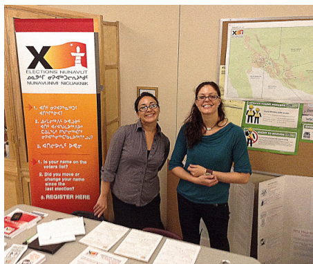
Mass registration in Iqaluit

3. Voter registration. All returning officers and assistant returning officers held registration events in their communities. Some set up tables at the Northern Store or local Co-op, some went door to door. Iqaluit returning officers participated in the annual mass registration while in Cambridge Bay the election staff registered voters at a local recreation event.