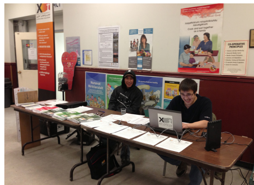
Registration event at the community hall in Cambridge Bay