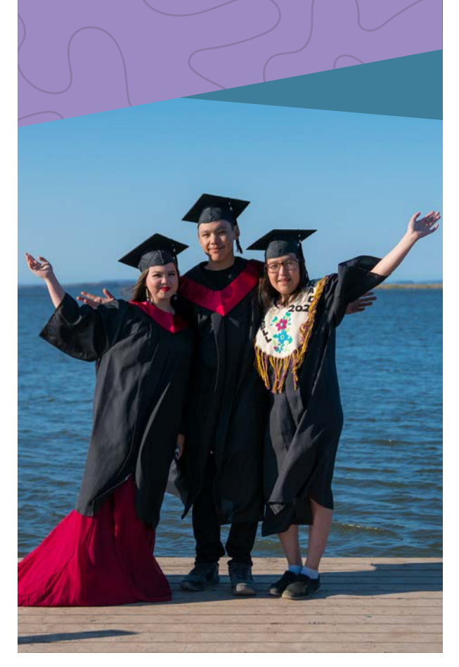
Kugluktuk High School Graduates

For instance, Tuugaalik High School in Naujaat organized a parade through the community with police leading the graduates. Afterwards, for the indoor ceremony, restrictions were placed on the number of people who could attend, and seating arrangements were made to accommodate social distancing. Organizers placed more effort on decorations so that beautiful photos could be shared online with those who could not attend.