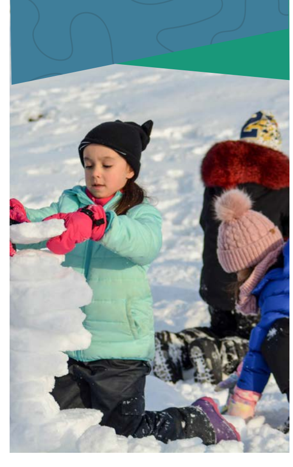
Cultural activities at Nanook School in Apex

The department's plan for curriculum development aligns with the schedule set