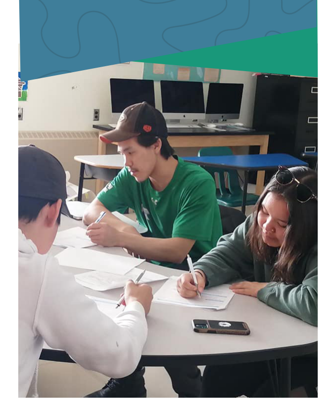
Inuglak students in Whale Cove, in preparation for summer employment

Nunavut schools are experiencing a teaching shortage. As of December 9, 2020, 34 NTA educator positions were available for competition across the territory. School staffing has been compromised because of the lack of housing for teachers. The department and Regional School Operations offices continue to discuss