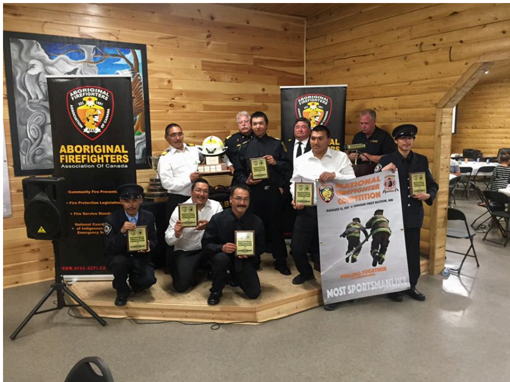
Team Nunavut at the National Aboriginal Firefighter Competition